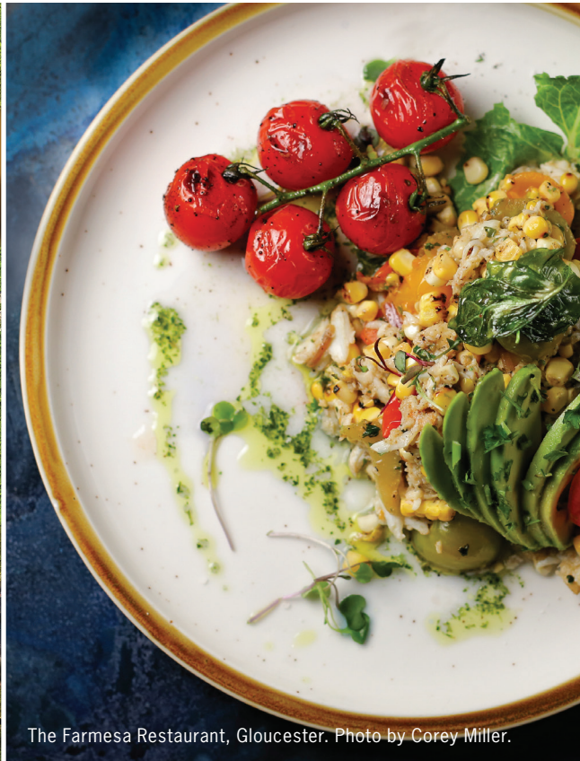
The Farnesa Restaurant, Gloucester.