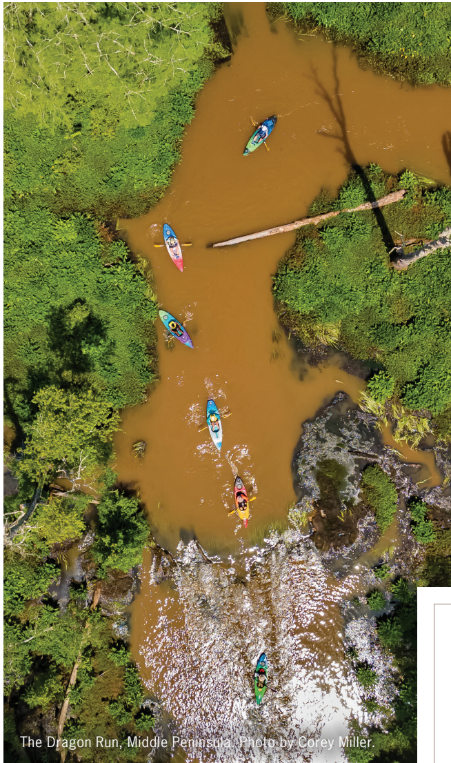
The Dragon Run, Middle Peninsula.